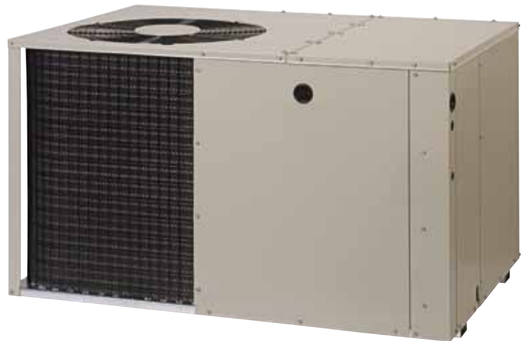
TARG / TPRG Series