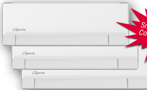
B-VMH06SV-1 to B-VMH24SV-1