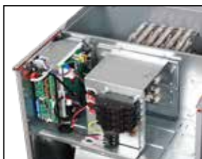
Wired programmable control