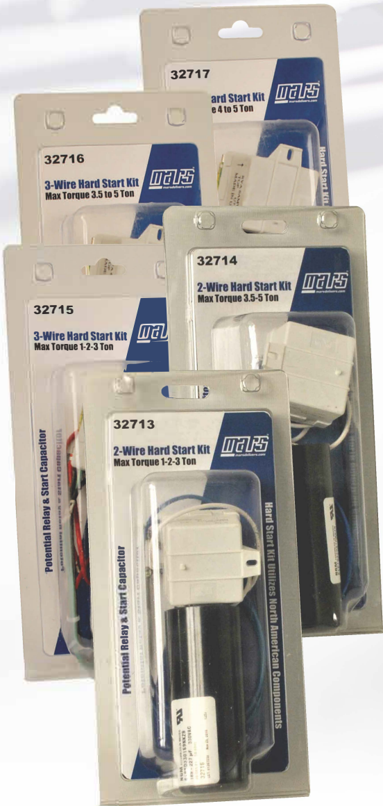
MARS 3 Wire Hard Start Kits